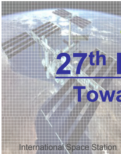
International Space Station