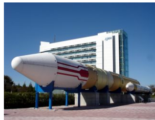
Tsukuba Space Center, JAXA