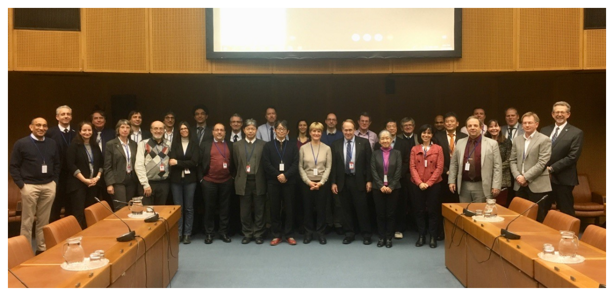
January 2019 Meeting of the COSPAR Panel on Planetary protection, Vienna, Austria