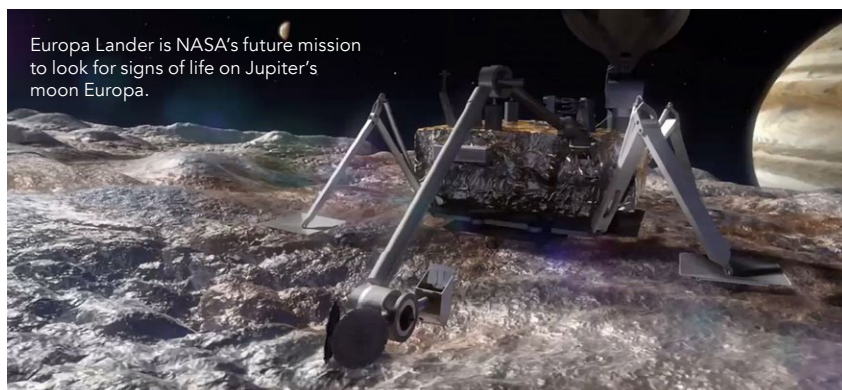
Europa Lander is NASA's future mission to look for signs of life on Jupiter's moon Europa.

Mars and the two moons Enceladus and Europa are all target planetary bodies where missions are considered Category III, IV or V. They are some of the most likely candidates to have life, or to hold clues as to how life evolved and was distributed within our solar system. Earth's space agencies, such as NASA, are working towards sending humans to