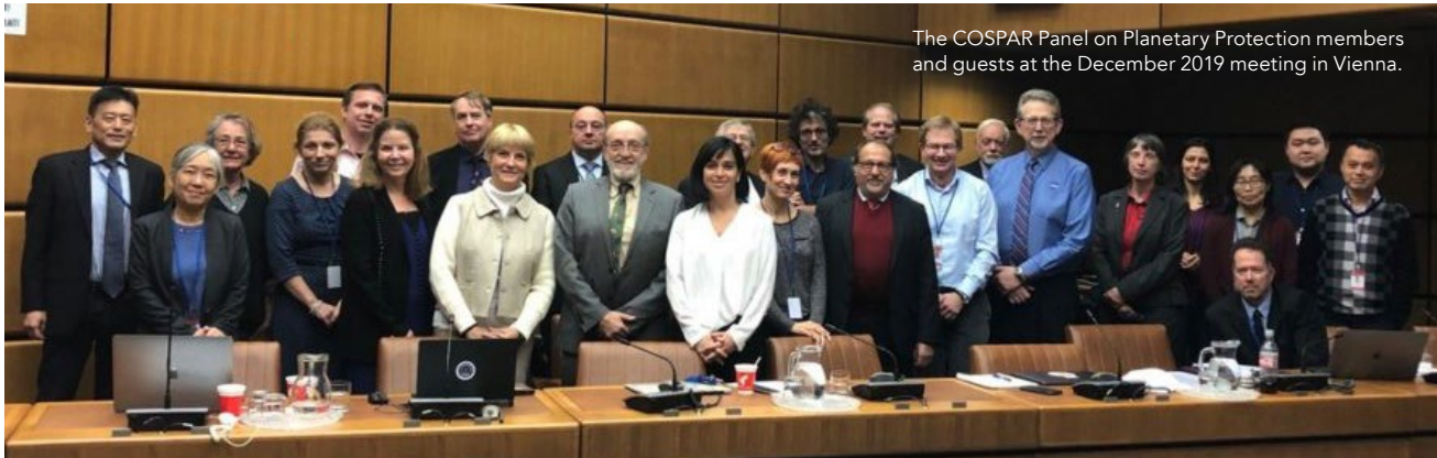
The COSPAR Panel on Planetary Protection members and guests at the December 2019 meeting in Vienna.