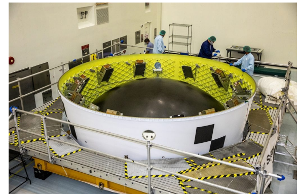
All 10 secondary payloads have been installed in the Space Launch System (SLS) rocket's Orion stage adapter.