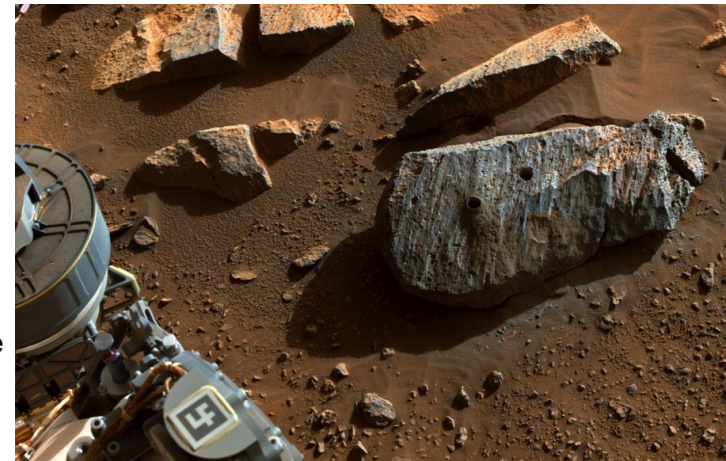
Image: NASA's Perseverance rover on Sept. 7, 2021, PDT (Sept. 8, EDT), shows two holes where the rover's drill obtained chalk-size samples from rock nicknamed "Rochette."