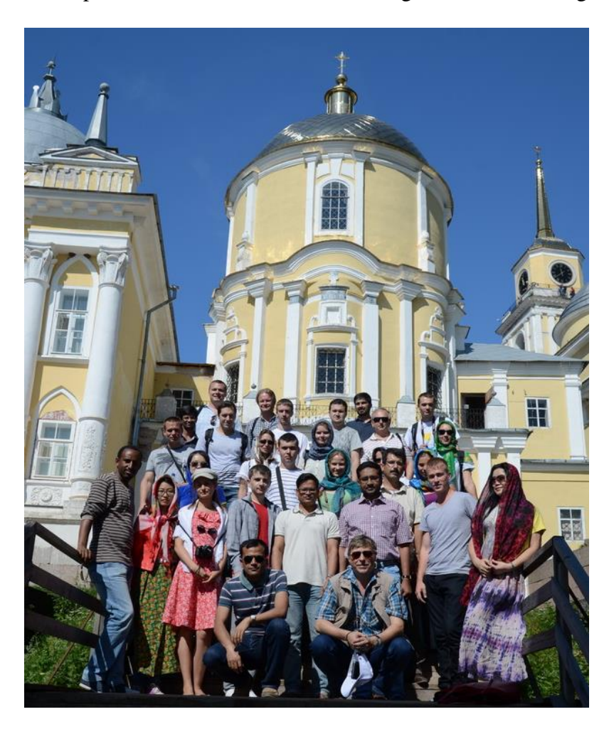
Participants of the CBW in Nilova Pustyn (active monastery established in 1594) on Stolbny Island in Seliger Lake.