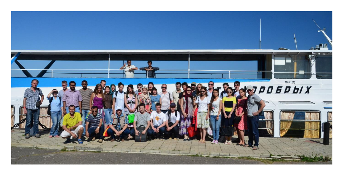
Participants of the CBW at the boat during excursion on Seliger Lake.