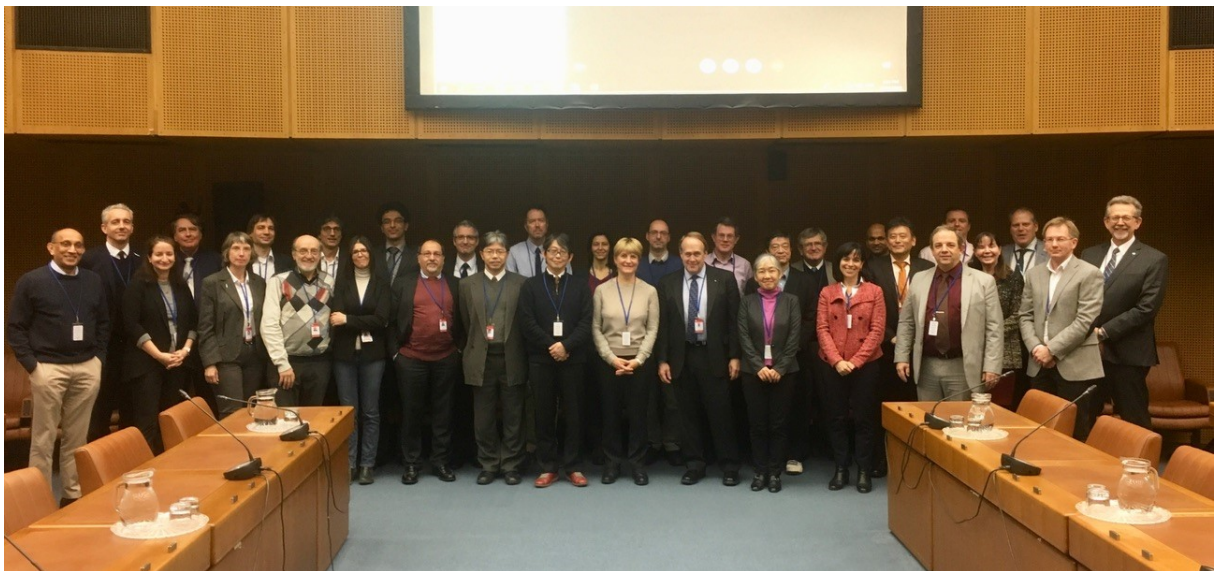
January 2019 Meeting of the COSPAR Panel on Planetary protection, Vienna, Austria